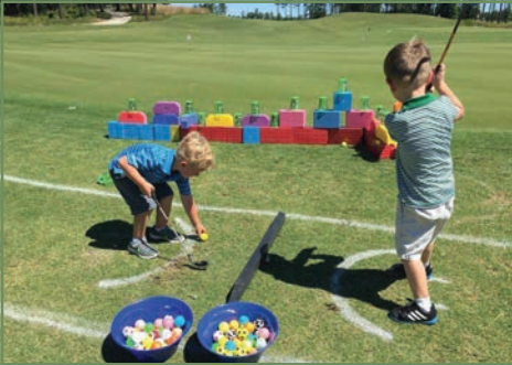
Spring Break Golf Camp