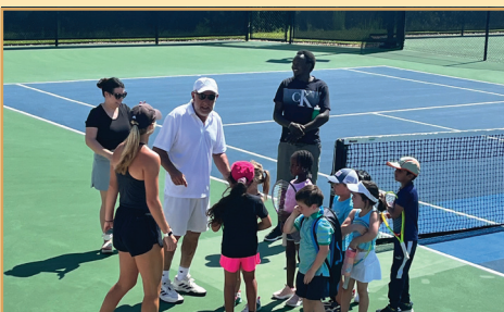
Spring Break Tennis Camp