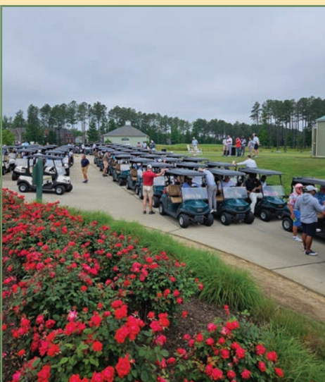
Darrell Green Celebrity Golf Classic