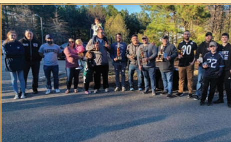
MG BBQ & Chili Cookoff