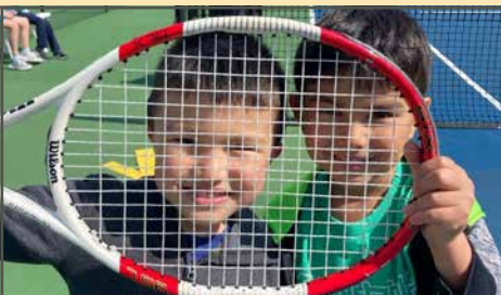
Spring Break Tennis Camp