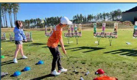
Spring Break Golf Camp