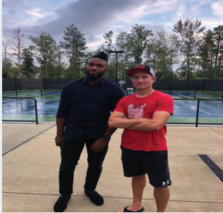
Men's Championship Bracket Winners