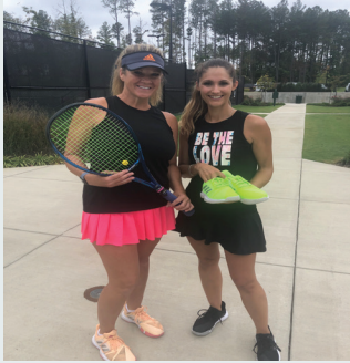
Women's Championship Bracket Winners

We had a record number of ladder players this season.