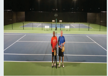
Men's Consolation Bracket Winners