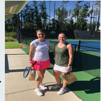
Women's Consolation Bracket Winners